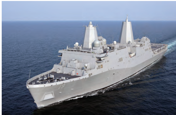
USS MESA VERDE (LPD 19)

The Mississippi Department of Employment Security has forged partnerships with many Mississippi companies to supply employers with qualified candidates for their open positions. These partnerships extend throughout the state and include small, medium and large employers.